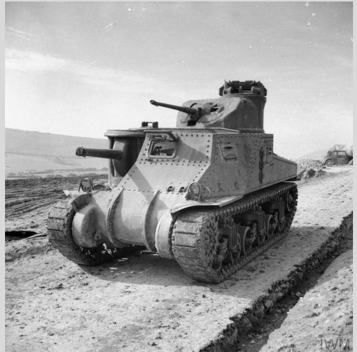
The M3 Grant Would be One of Many New Tanks to be Fielded in North Africa

The British Eighth Army would hold the line at El-Alamein over the month of July 1942. Intelligence passed on by Ultra, the Allies' decryption of Axis radio messages, would allow British forces to pre-emptively attack German and Italian forces on more than one occasion.