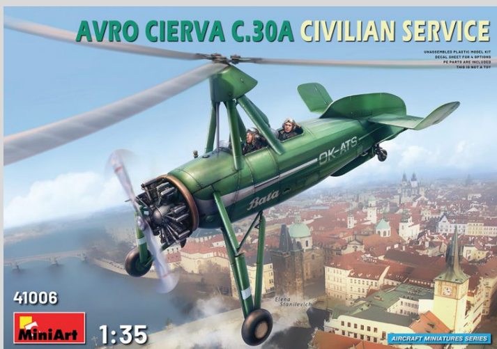
Avro Cierva C.30A