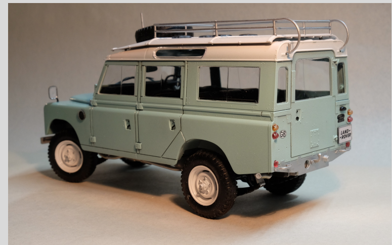
Passenger Side View