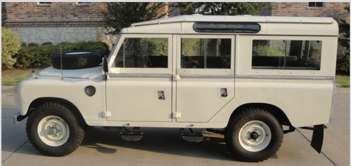
The Real Deal