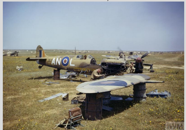
Ground Crew Servicing Spitfires of No. 417 Squadron RCAF