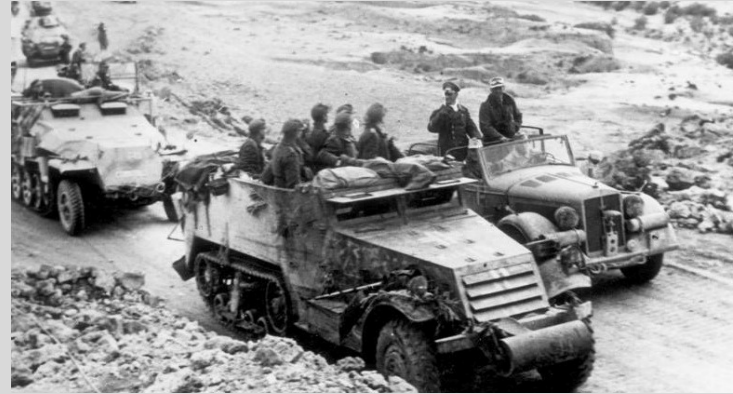
German Half-tracks (including a captured US M3) Stop to Receive Orders from Rommel somewhere in Tunisia, Winter 1943

The Allied invasion of French North Africa, codenamed Operation Torch, was launched on November 8th. Primarily U.S. forces would land across three beachheads in Morocco and Algeria, respectively. It would not be long before French colonial forces would surrender or switch allegiances. Allied forces would amass strength over the following months before launching the final push against Axis forces squeezed back into Tunisia.