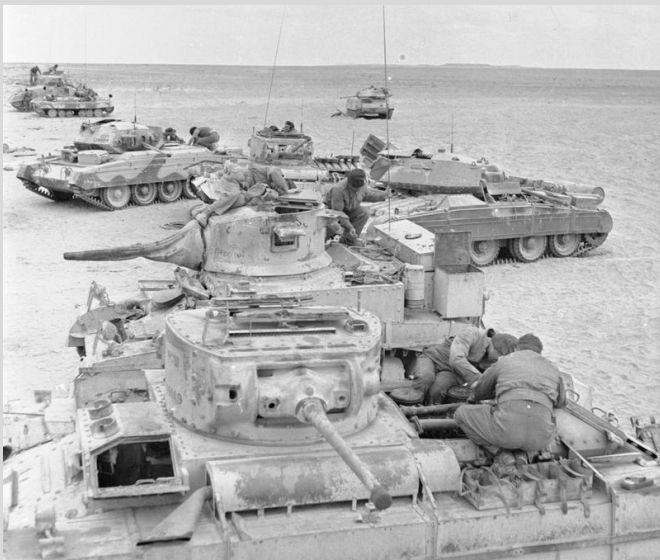
A Mixed Group of Valentine and Crusader Tanks somewhere in Tunisia

Major General Bernard Montgomery assumes command of the British Eighth Army in August 1942. Soon thereafter, Rommel would launch a last ditch attack to rout British forces and drive on Cairo. Once again, Allied intelligence would pass on advance notice of the coming attack. The Battle of Alam el Halfa would see British anti-tank guns and tanks hold back repeated attacks by German and Italian armour. Rommel would withdraw his forces on September 5.