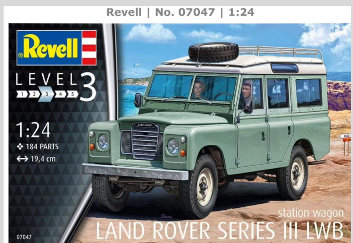
Revell Kit No. 07047 Boxart

Best $60 you could spend for that entertainment and satisfaction.