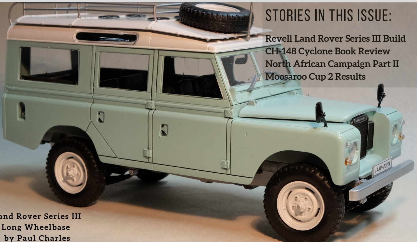
Land Rover Series III Long Wheelbase

The Quarterly Newsletter of the IPMS Hamilton Modellers Club