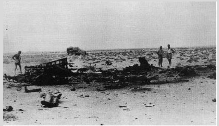
Wreckage of Hans-Joachim Marseille's BF 109 The "Star of Afrika" Somewhere in Egypt

Axis forces launch Operation Theseus in late January against tired and overextended British forces. By early February, British forces would be pushed back to the Gazala Line only a few miles from Tobruk. Losses were heavy on both sides.