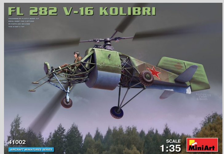
FL 282 V-16 Kolibri "Humming Bird"