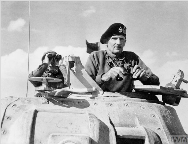
Major General Bernard Montgomery November 1942

http://www.desertrats.org.uk/assoc/northafricanmappage.htm