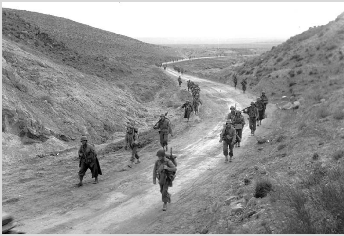
U.S. Troops Move through the Kasserine Pass in February 1943