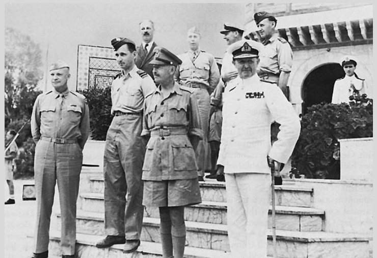
Planning for the Launch of Operation Husky...and the Rest is History