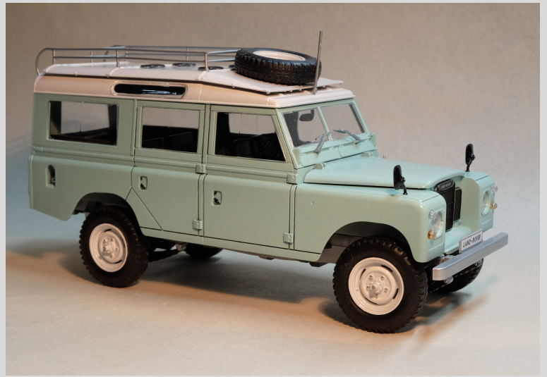
Drivers Side View