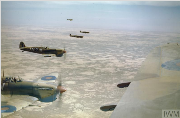
No. 417 Squadron RCAF Flying in Formation over Tunisia

The Kasserine Pass, an approximately 3 km gap in the Atlas Mountains of central Tunisia, was the the location of a series of battles between the Afrika Korps and primarily U.S. forces. U.S. forces incurred a series of early defeats that would see a change of leadership with Major General Patton taking command of the U.S. II Corps in early March 1943. Patton would not get his chance to take on Rommel directly as he had already withdrawn the majority of his forces to defend he Mareth Line in late February.