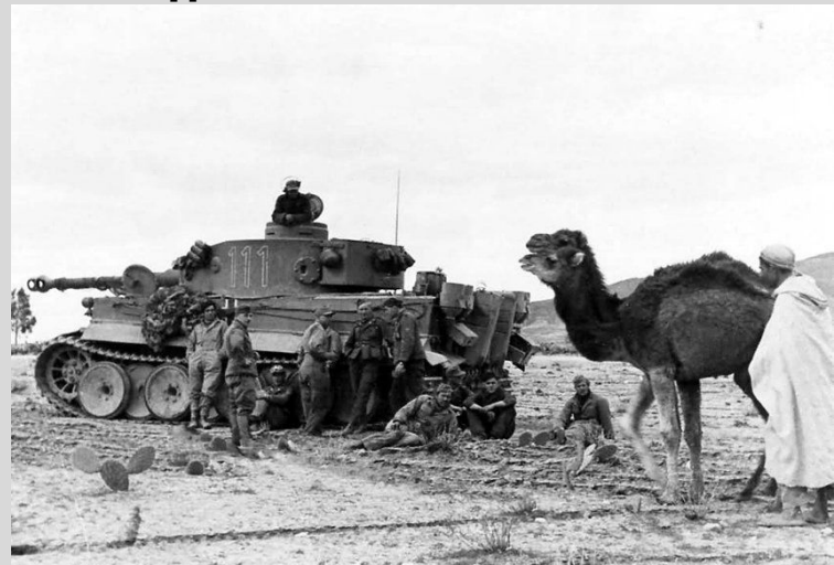
A Tiger I Deployed to Tunisia to Bolster Faltering Axis Forces

Operation Lightfoot, or what would become known as the Second Battle of El-Alamein, would launch at 21:40 on October 23. Following a short artillery barrage, infantry would cross the start line with the goal of opening up travel lanes through the mine fields that separated the opposing forces. The next week would see a steady advance by Allied forces. Rommel (recently returned to the theater of operations) and the Afrika Korps would see their strength quickly eroded away due to a lack of healthy reinforcements, replacement equipment, and basic supplies.