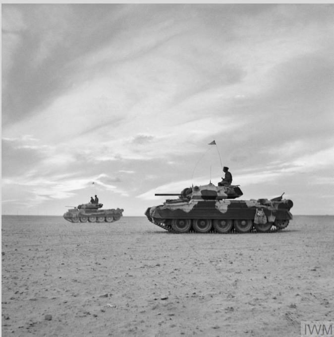
British Crusader Tanks Waiting to Launch an Attack during the Battle of El-Alamein